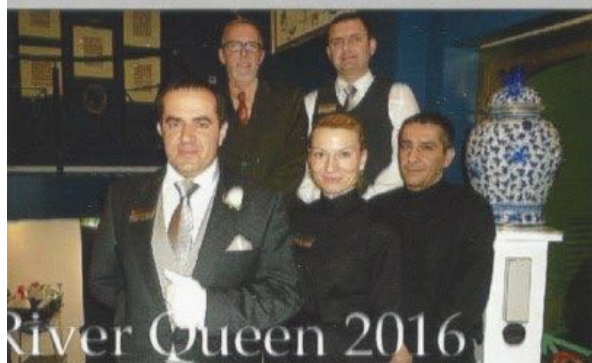
River Queen 2016